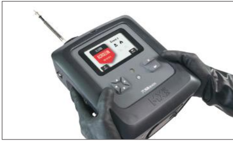
MX908 is rugged and meets the requirements for use in harsh environments.