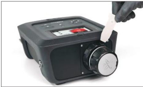
MX908 is equipped with modular accessories for ease of transition between solid and vapor sample types.