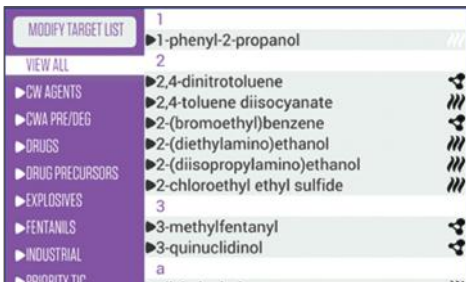
The enhanced selectivity of MX908 allows for even broader threat category coverage.